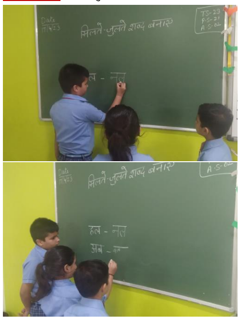
छात्रों ने अपनी सूझ बूझ के द्वारा छात्रों ने दिए गए शब्दों के मिलते जुलते शब्द बनाए ब

इस गतिविधि में, छात्रों को पिक्षयों पर हिंदी में किवता का चयन करने के बाद उसकी समझ और व्याख्या करने का मौका मिला | जिससे उन्होंने पसंदीदा पंक्तियों को चुनकर उसका चित्रण किया और अपने सहयोगियों के साथ उनका साझा किया | इस गतिविधि से वे पिक्षयों की दुनिया में रोमांचित हुए |